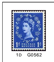
1D G0562 Y0307 S0318d M0283z