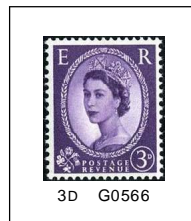
3D G0566 Y0311 S0322d M0287z

Reina Isabel II (Básica) (Filigrana Corona de Eduardo y E 2 R múltiple) (Lineas Negras en neverso y bandas fosforescentes en anverso) 1959