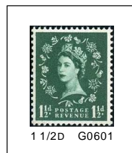
1 1/2D G0601 Y308a S0319dp M0284y