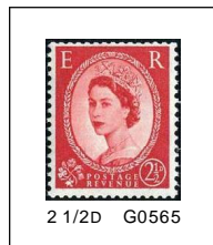
2 1/2D G0565 Y0310 S0321c M0286z