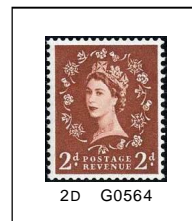
2D G0564 Y0309 S0320c M0285z