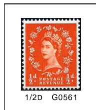
1/2D G0561 Y0306 S0317c M0282z

Reina Isabel II (Básica) (Filigrana Corona de Eduardo y E 2 R múltiple) (Lineas negras en reverso) 1957-59