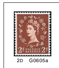
2D G0605a Y309a S0320cp M0285y